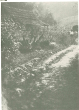
Roads - always dirty, dusty, muddy, or rutted - but the countryside always a scene of tranquil beauty. This scene taken on Copeland around 1927.